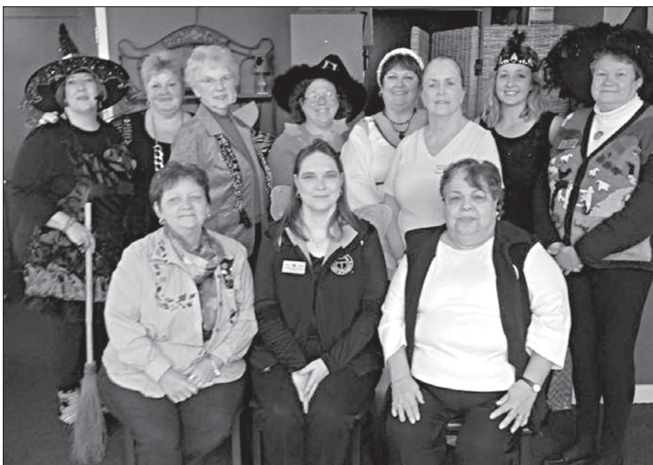
Junior Fall Conference Attendees