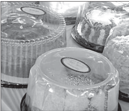
Just a few of the many cakes provided by Laytonsville club members for the Cake Walk at the annual Town Picnic.