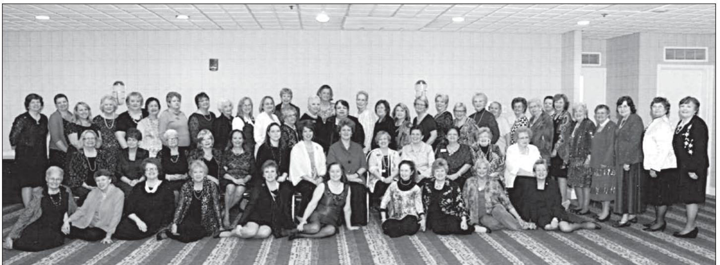
The GFWC Maryland Delegation