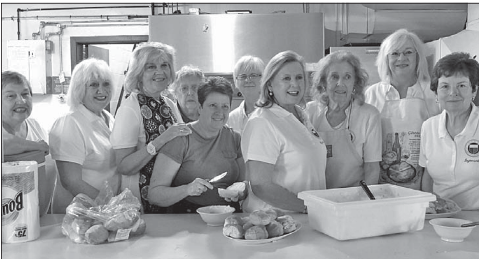
Members of the Woman's Club of Laytonsville providing lunch for the volunteers at Laytonsville's Annual Town Parade.

Friday afternoons knowing they will have little or nothing to eat until they return to school on Monday morning. We hope that "Weekend Tummy Tamers" will make a positive difference in the lives of those kids.