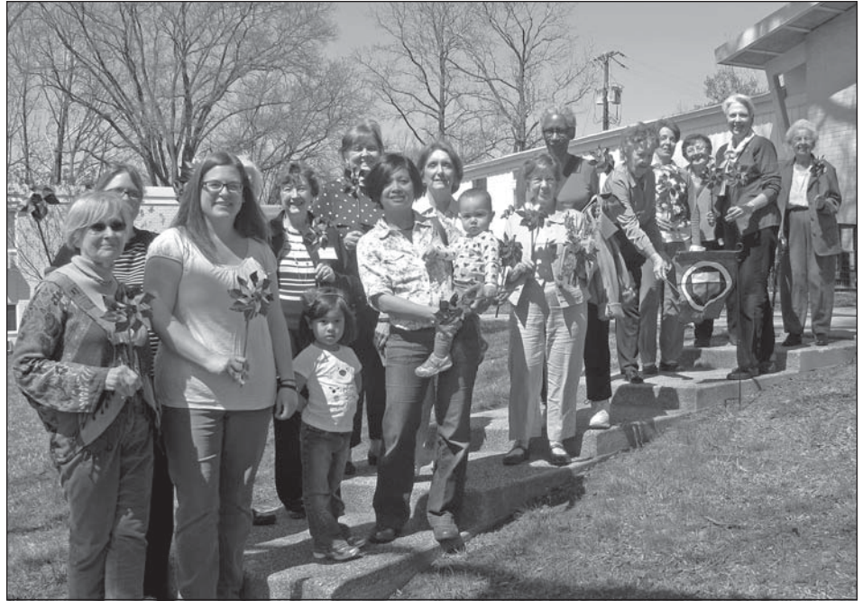
Members of the University Park Woman's Club pose with pinwheels in support of the Pinwheels for Prevention of Child Abuse project.

Our autumn activities began with the Town Picnic in September, where our members provided the homemade cakes and other desserts for the popular annual Cake Walk. In addition, we handled the sales table for our own fundraiser items and for town souvenirs.