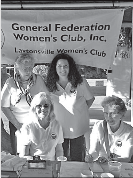
Laytonsville club members working the sales table at Laytonsville's annual Town Picnic.