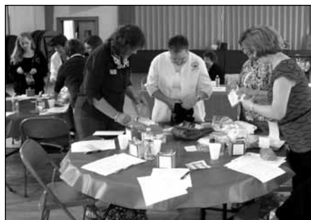
Members worked together on a "Parade of Projects" at Junior Fall Conference.

The Service Project for the day was called a "Parade of Projects." We collected quite a few baskets filled with non-perishable items, four backpacks filled to the brim with school supplies, and dozens of pairs of socks for the "Step Away From Abuse" project. The bulk