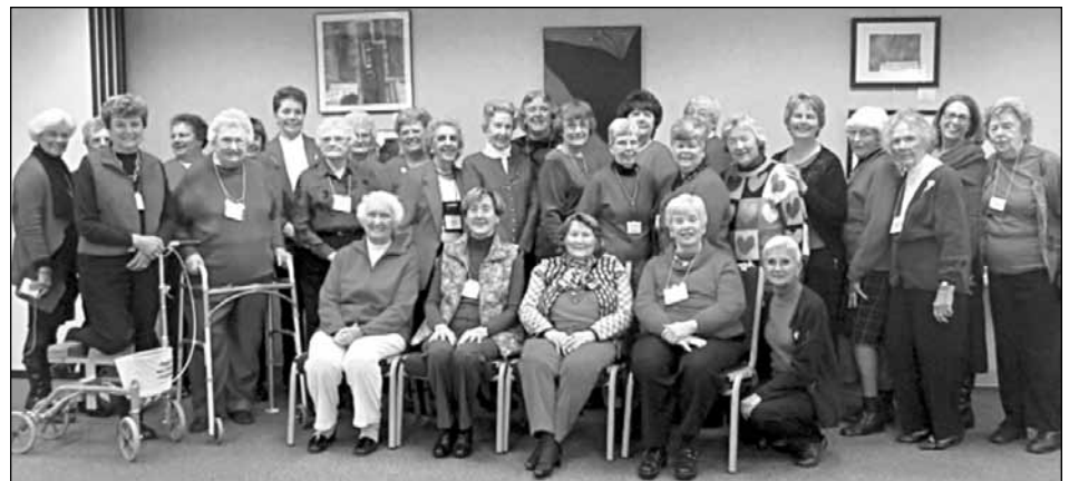
Members of the Woman's Club of Westminster all dressed in red for Heart Health Month in February 2013.

We received a $50 membership grant from GFWC and are excited to use it as part of our "GFWC—Girl Friends Wine Club." We wanted to find a way for our members and friends to have a relaxing evening together to discuss many other topics that affect us. We often have so much business to conduct at a meeting that we lose site of other matters around us that