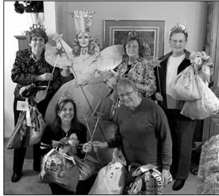
"A Gathering of the Good Witches"—WMCC members participated in GFWC Advocates for Children Week at their October Meeting and Halloween Party with the GFWC Pillowcase Project.

In October we celebrated all the "good" we do in our community with "A Gathering of the Good Witches." (Glinda the Good Witch was in attendance.) We participated in GFWC Advocates for Children Week with the GFWC Pillowcase Project. We purchased colorful kids pillowcases and filled them with small toys, books, stuffed animals, pajamas, etc. The pillowcases were tied with ribbon and a tag was