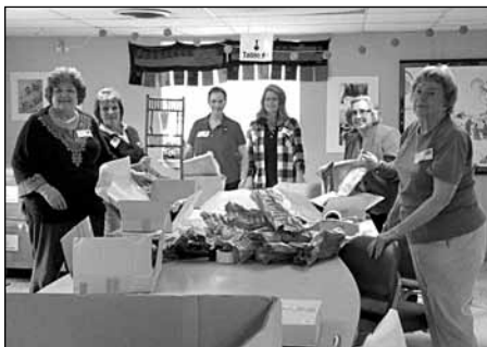
Centennial Club Members volunteer at the SERRV warehouse in New Windsor.

In October, our members returned to New Windsor, MD to volunteer at the SERRV warehouse. Members gathered to unpack huge boxes of Fair Trade items, inspect, count, and repackage the items for sale. Beautiful arts, crafts, clothing and even household goods can be purchased at their store or online to aid families and villages around the world. Our members are truly committed to “Living the Volunteer Spirit.”