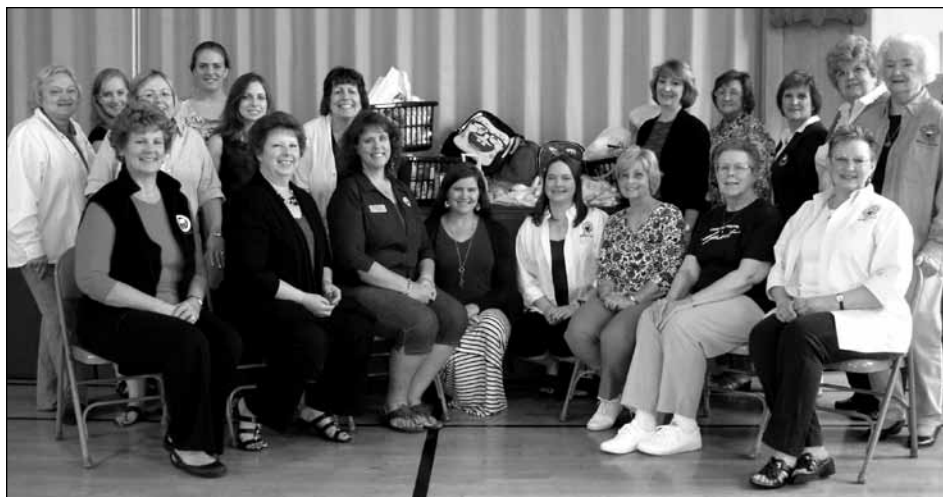
Junior Fall Conference Attendees