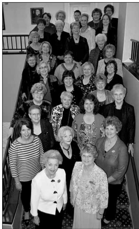
The GFWC Maryland Delegation