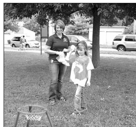
Local kids enjoyed games sponsored by the Westminster Juniors at Westminster’s National Night Out.