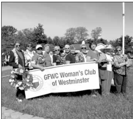
Woman's Club of Westminster members prepare to march in Westminster's 146th Memorial Day Parade.

Through ornament sales and a silent auction at our holiday luncheon, the Fundraising Committee is the major source of club funds, enabling each community service project to make donations. The club just presented its 10th and 11th ornaments in its annual series depicting Westminster's important buildings.