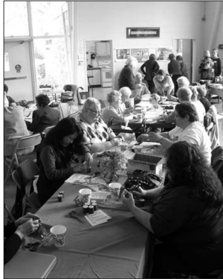
University Park Woman's Club members gathering for a "Conversational Crafting Bee" in November 2014.

In March, the UPWC and the Laurel Women's Club co-hosted the Montgomery County District Meeting at the Riverdale Presbyterian Church