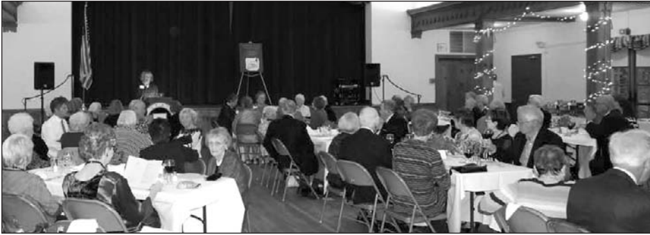
Chevy Chase club members held a Gala Book Party at their clubhouse in October to celebrate the publication of "The Woman's Club of Chevy Chase: Our First Century."