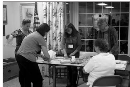
Laurel Club members put finishing touches on book packets for their “Literacy for Little Ones” project.

November was a busy month. On Election Day, our club members turned out as always to help at the polls and to staff sales tables for the Woman’s Club, Town of