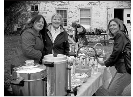
Chevy Chase Juniors held a Rummage Sale and Flea Market in November.

Our final fundraiser for this club year will be our annual wine tasting event, "UnWined: A Charity Wine Tasting." The Wine Tasting will be held on Saturday, March 21st at Huckleberry Fine Arts Gallery in Rockville. JWCCC has had an exciting fall and winter season and looks forward to a great spring!