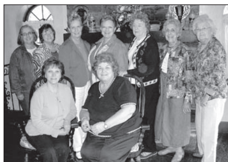
Centennial Club members gather for lunch at their favorite restaurant—Gladchuk's—after their May Meeting.