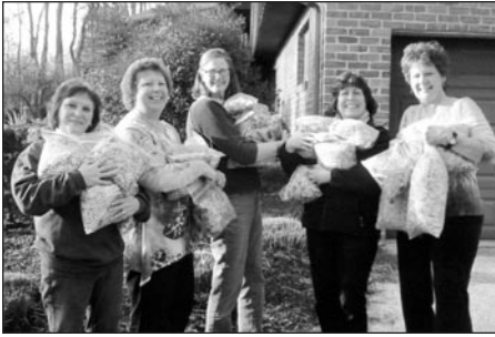
Members of the Junior Woman's Club of Westminster hold 75 lbs. of pull-tabs collected for Ronald McDonald House.

We gathered for our "social" meeting at a member's home in August. Members were encouraged to bring family and friends so they could learn about our club and the work we do! Our summers are always spent planning for our biggest event, our Kid's Consignment Sale, which celebrated its 21st anniversary this year. We had another fantastic sale, bringing in thousands of dollars to use for the betterment of our community. We are also thankful to the consignors who decide to donate their un-purchased items. This allowed us to donate a large truck-load of children's clothing and toys for distribution to needy families.