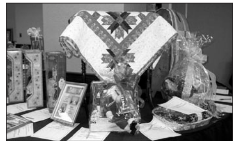
A sampling of the more than 75 Silent Auction items up for bid at the Severn Town Club's Holly Ball.