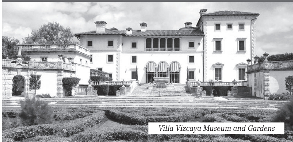
Villa Vizcaya Museum and Gardens

122ND GFWC ANNUAL INTERNATIONAL CONVENTION, JUNE 30-JULY 2, 2013 THE WESTIN DIPLOMAT RESORT & SPA • HOLLYWOOD, FLORIDA