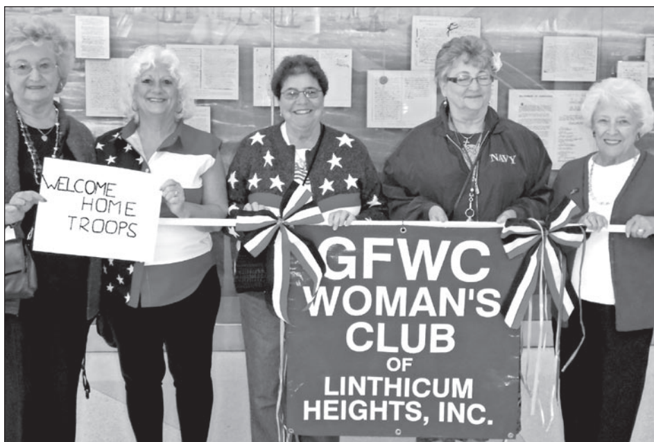
Members of the Woman's Club of Linthicum Heights help welcome home the troops at BWI Airport, in conjunction with Operation Welcome Home Maryland.