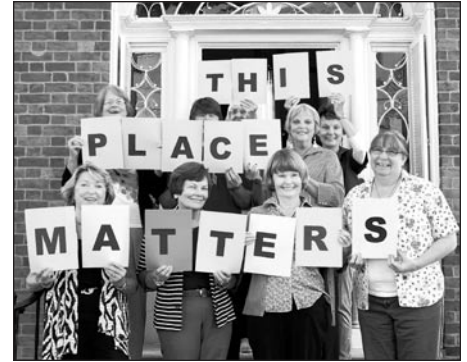
The Frederick Club's Steiner House recently took its place among other historic landmarks as a participant in the National Trust for Historic Preservation's This Place Matters program.

To accommodate the different family and work situations of our members, we hold both daytime and evening meetings. We have an active Book Club and a Bunko Group that donates its fees to the scholarship