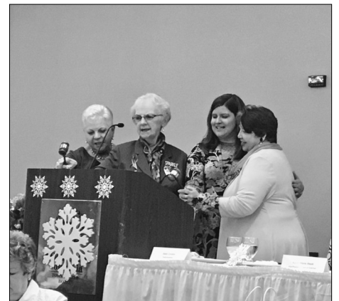
Past and newly-installed State Presidents and Junior Directors usher in a new