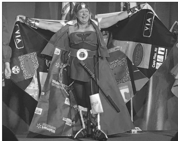
"Wonder Woman" was the winning costume from the GFWC Conservation Challenge.