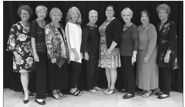
GFWC Maryland Clubwomen at International Convention.