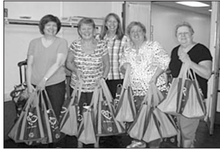
GFWC Woman's Club of Laurel— The Community Improvement Program 4th Place Award Winner at the 2016 GFWC Annual Convention in Baltimore.