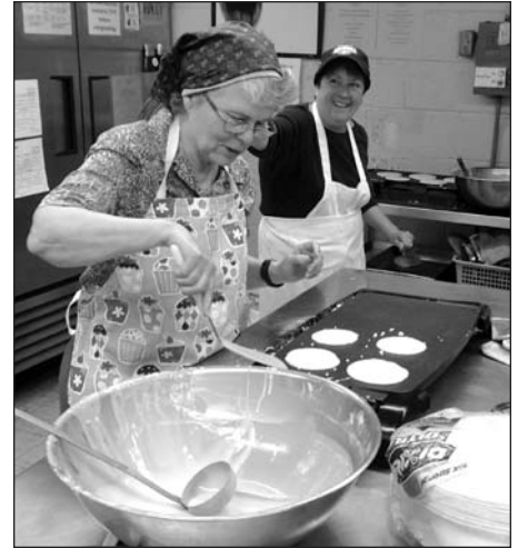
Laytonsville members volunteering at The Lord's Table interfaith soup kitchen.