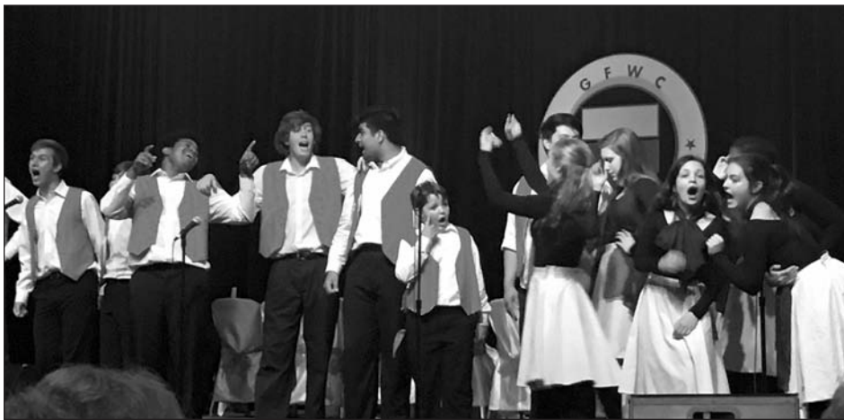
The Young Columbians received a standing ovation for their State Night performance.