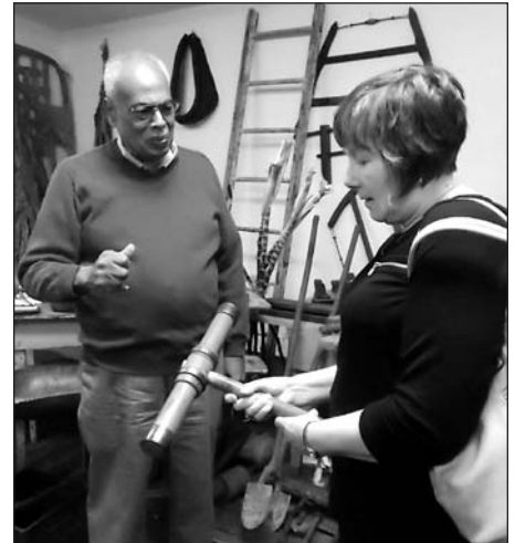
Laytonsville Club members visit the Sandy Spring Slave Museum and African Art Gallery.