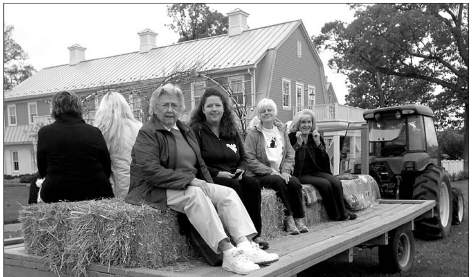
Laytonsville Club members enjoy a November Hayride at Ruppert Nurseries.