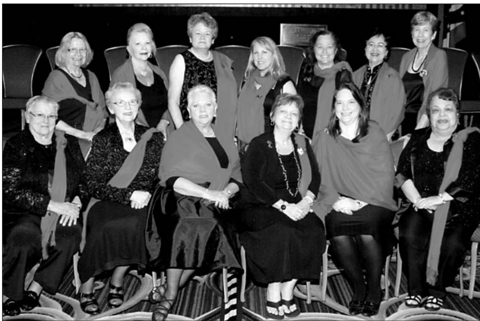
The GFWC Maryland Executive Committee—