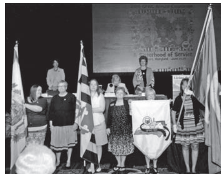
GFWC Southeastern Region