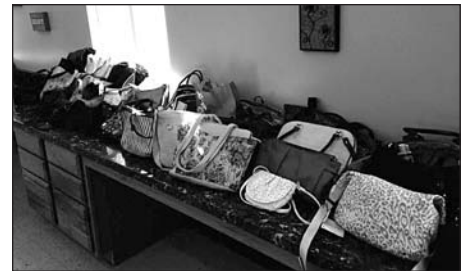
The GFWC Junior Woman’s Club of Westminster participated in the Western District “Purses of Promise” project.

and taught members how to prepare the dishes that were served. The Culinary Arts Program trains students for careers in the food service industry and is certified by the American Culinary Federation.