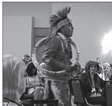
Members of the Gila River Indian Community demonstrated various tribal dances at Friday’s banquet.