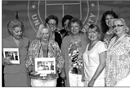
Members of the Frederick Woman's Civic Club, Inc. accept their award from the U.S. Fund for UNICEF.

As this was an election year, Sunday gave attendees an opportunity to meet the candidates. Although only one office, Treasurer, was contested, each candidate offered her plans for the next two years. Maryland won the Category III Newsletter Award during the Rays of Light Partnership Luncheon. This award was certainly well deserved! The afternoon business session included recognition of the Past GFWC Presidents.