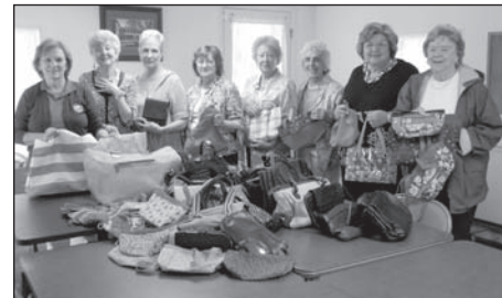
Centennial Club members participated in Western District's "Purses of Promise" project by donating, filling and distributing 66 purses to domestic violence shelters in four counties.

As a club, we continue to support our organization by donating to "The Maryland Clubwoman" magazine, 1734 Society, Bettie M. Sippel Memorial Endowment Fund, Women's History & Resource Center, the GFWC-MD Website, Tree-Mendous Maryland and the Chesapeake Bay Foundation. Our members will continue to offer guidance and support to the clubs of Western District, Inc.