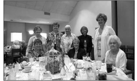
Members of the GFWC Woman’s Club of Westminster, Inc. attending their Spring Luncheon.

In the spring, members participated in a fundraiser for the club and the Carroll County Career and Technology Center. Students in the Center’s Culinary Arts Program prepared and served a delicious luncheon,