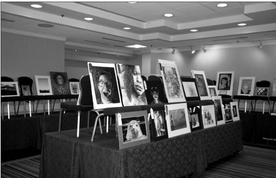
This year's Youth Art Contest winners and entries presented an impressive display of the talent and passion of our young people.