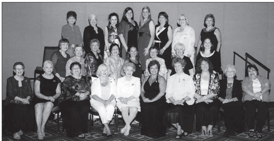
The GFWC Maryland Delegation.