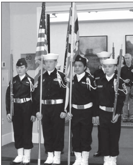
GFWC-MD Convention opened with the Presentation of Colors by the Navy League Cadets.