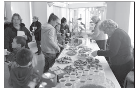
Woman's Club of Cecil County members serve at the reception for the Winter Arts Festival.