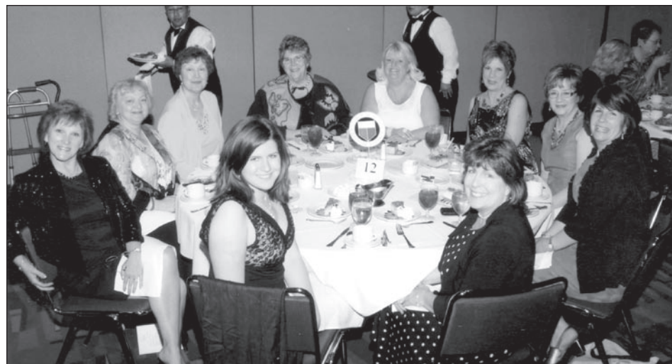
Maryland Ladies enjoying Luncheon with GFWC Members from other states.