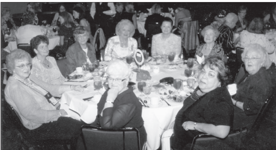
Maryland Ladies attending the "Creating a Better Tomorrow" Banquet.