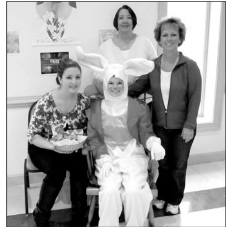
Miss Pocomoke graciously agreed to be the Easter Bunny for the Pocomoke Juniors' Bunny Breakfast.

We are also planning a New York Trip on November 10th, with the proceeds going toward next year's Relay. As we think about Thanksgiving and adopting families that can't afford a Thanksgiving dinner, we are all feeling very blessed. We will also provide Meals-on-Wheels to