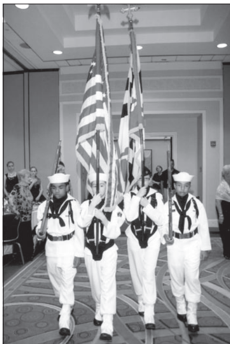
The Navy League Cadets