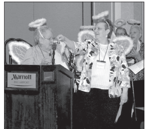
The GFWC-MD Officers’ Report... Every time a bell rings, an Angel gets its wings.