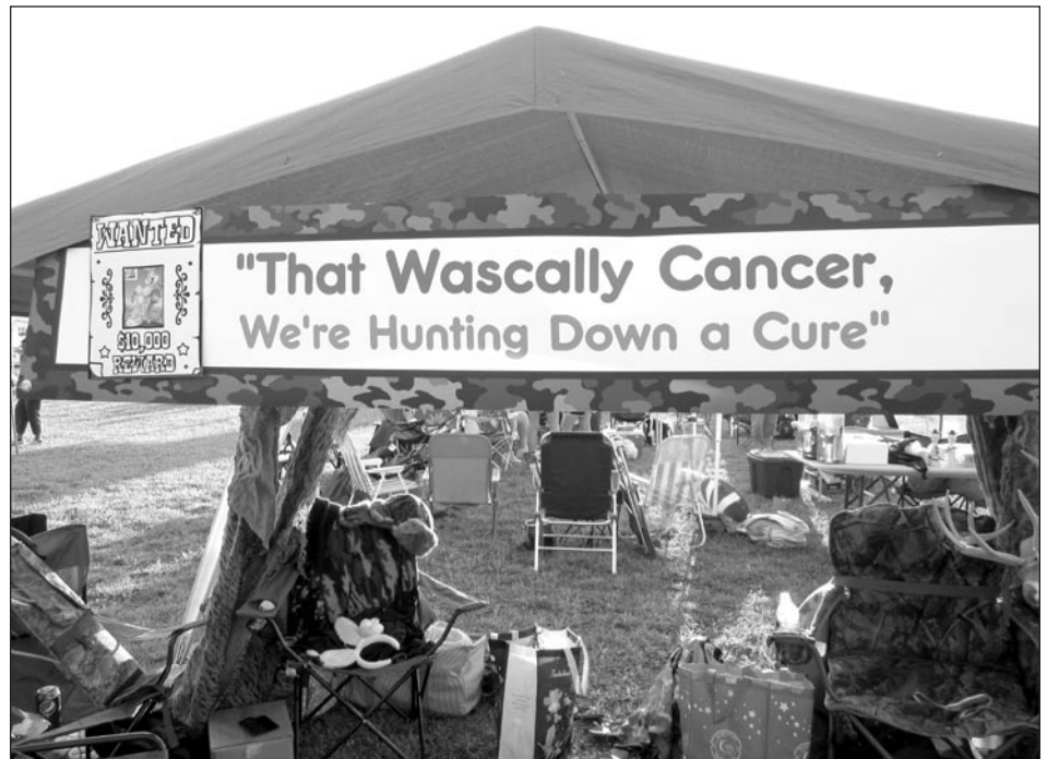
Pocomoke Juniors' Campsite wins First Place at the June 2012 Relay-for-Life.